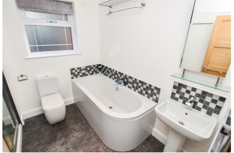
Family Bathroom 8'2" x 5'8" (2.49m x 1.73m)

Upvc obscure double glazed window to side aspect, smooth plastered ceiling, vinyl flooring, spotlights, large tiled shower cubicle with shower tower panel, panelled bath with chrome mixer tap and mosaic style splashback, pedestal wash hand basin with chrome mixer tap, close coupled W.C.